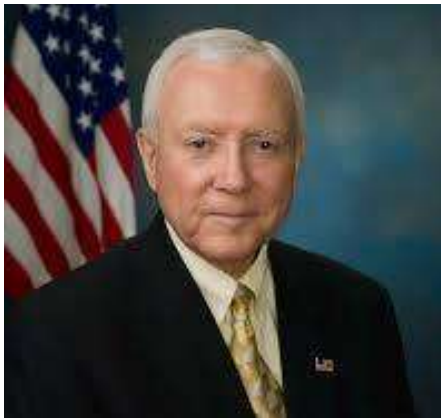
Senator Orrin G. Hatch, 2021